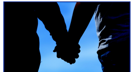
The Journey to Be Me