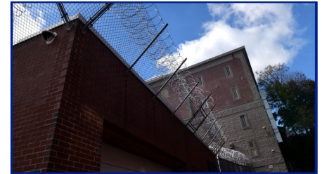
Eavesdropping in Maine Jails